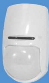
Large PIR Sensor