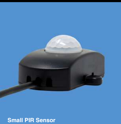
Small PIR Sensor