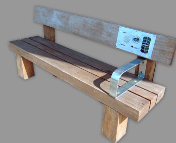
Audio Bench - Heavy Duty