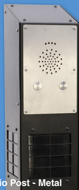
Solar Audio Post - Metal