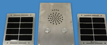
Solar Audio Post - Electronics