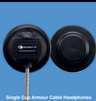
Single Cup Armour Cable Headphones