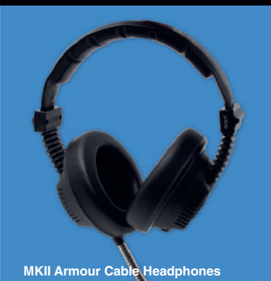
MKII Armour Cable Headphones