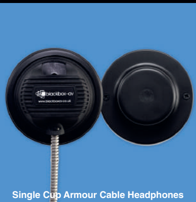
Single Cup Armour Cable Headphones