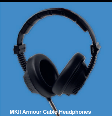
MKII Armour Cable Headphones