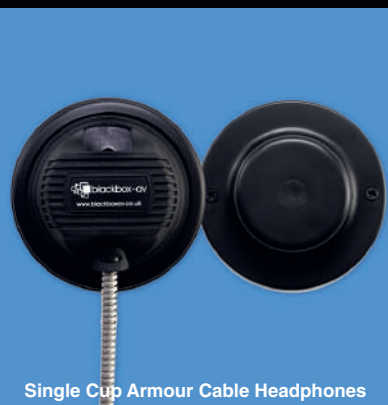
Single Cup Armour Cable Headphones