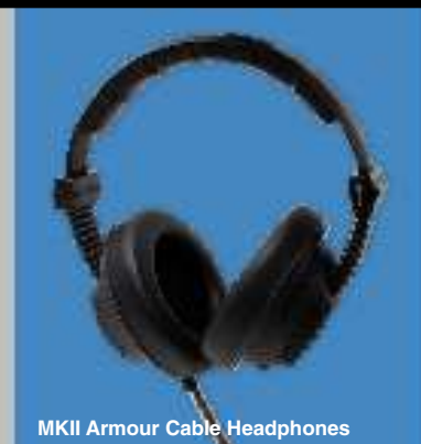
MKII Armour Cable Headphones