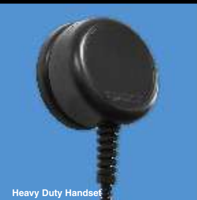
Heavy Duty Handset