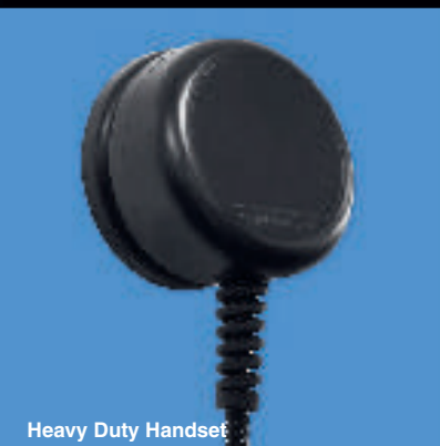
Heavy Duty Handset