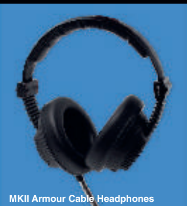
MKII Armour Cable Headphones