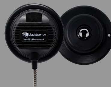
Single Cup Headphones