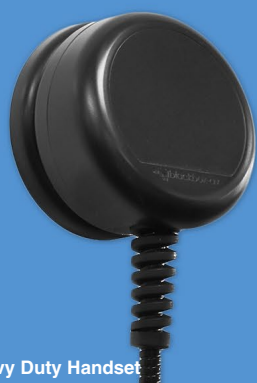
Heavy Duty Handset