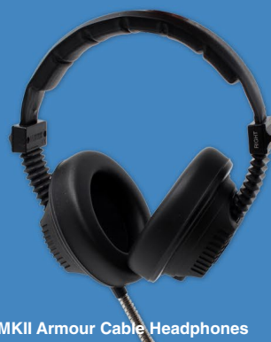
MKII Armour Cable Headphones