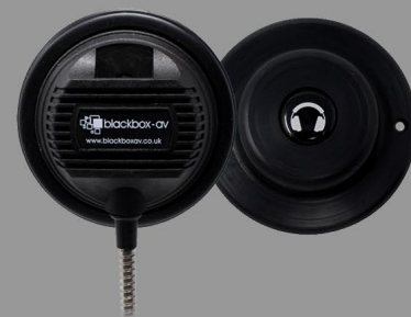
Single Cup Headphones