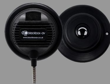
Single Cup Headphones