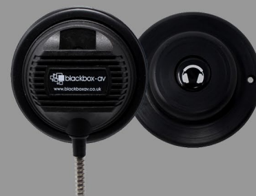
Single Cup Headphones