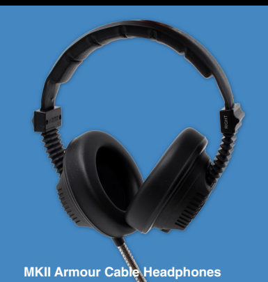
MKII Armour Cable Headphones